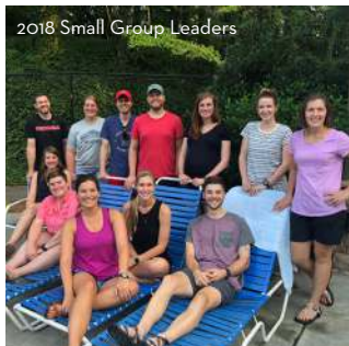
2018 Small Group Leaders