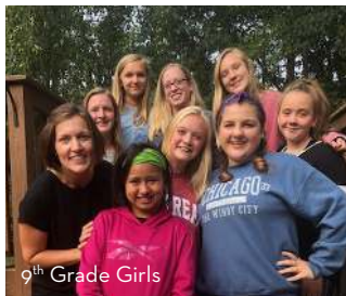
9 th Grade Girls