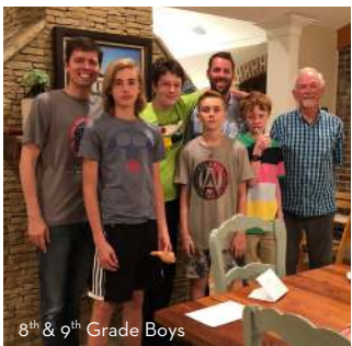
8 th & 9 th Grade Boys