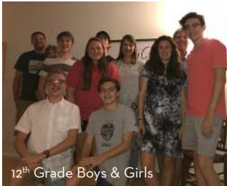
12 th Grade Boys & Girls