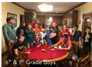
6 th & 7 th Grade Boys