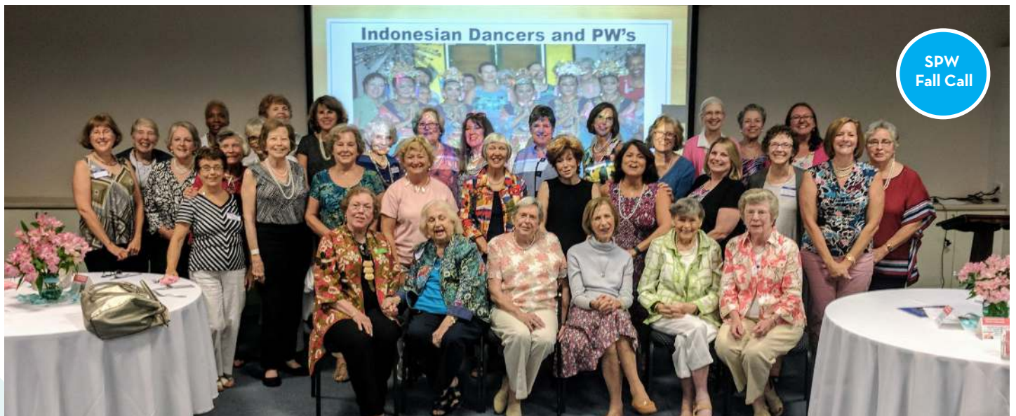
SPW Fall Call