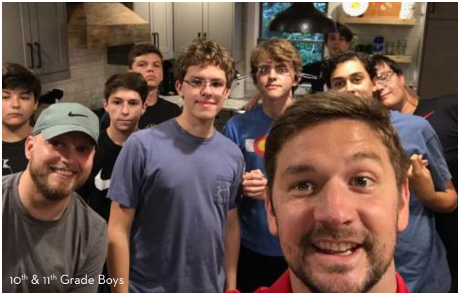
10 th & 11 th Grade Boys