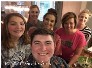
10 th & 11 th Grade Girls