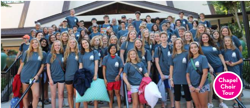
Chapel Choir Tour

Each week, members of the Shallowford family worship in our sacred spaces, gather for churchwide events and programs, and volunteer to help others. Take a look at some of our more recent highlights from a few activities in 2018. Find us on Facebook ( Shallowford Presbyterian Church ) for a more in-depth look into our fun and fellowship!