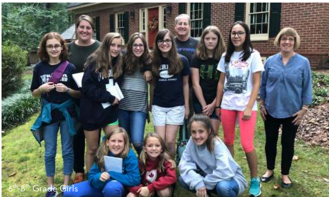
6 th -8 th Grade Girls