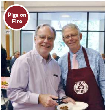
Pigs on Fire