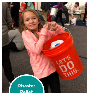
Disaster Relief Efforts