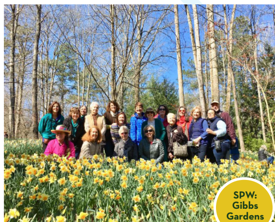
SPW: Gibbs Gardens