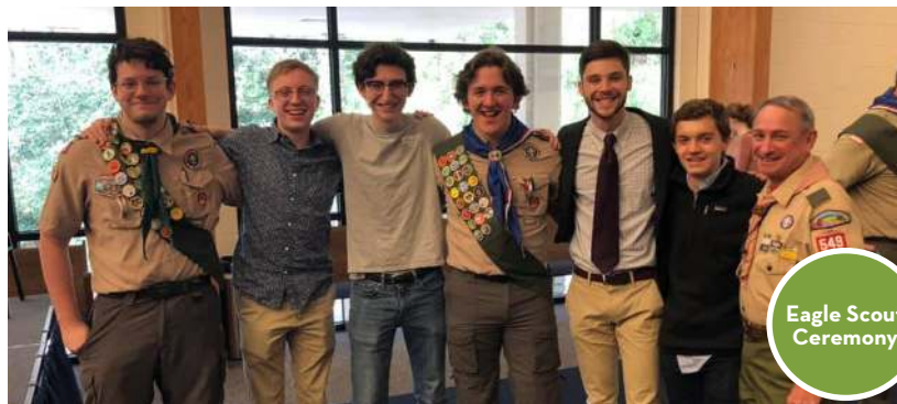
Eagle Scout Ceremony

Each week, members of the Shallowford congregation worship in our sacred spaces, gather for churchwide events and programs, and volunteer to help others. Below are a few recent highlights from activities in 2019. Find us on Facebook ( Shallowford Presbyterian Church ) or Instagram ( @Shallowfordpc ) for an in-depth look into our fun and faith-filled fellowship!