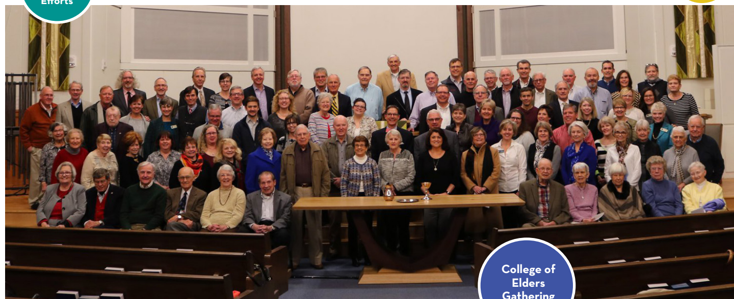
College of Elders Gathering