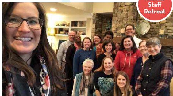
Annual Staff Retreat