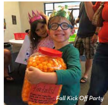
Fall Kick Off Party