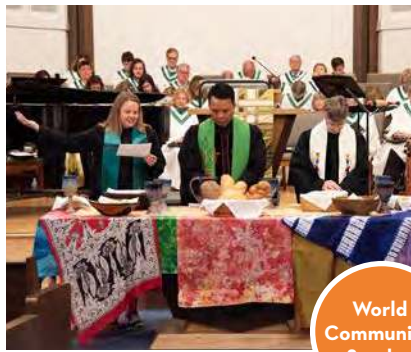
World Communion Sunday