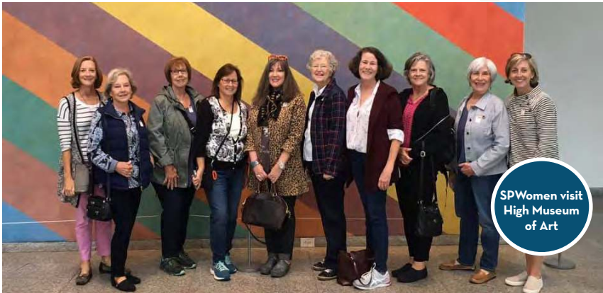
SPWomen visit High Museum of Art

Each week, members of the Shallowford congregation worship in our sacred spaces, gather for churchwide events and programs, and volunteer to help others. Below are a few recent highlights from activities in 2019. Find us on Facebook ( Shallowford Presbyterian Church ) or Instagram ( @Shallowfordpc ) for an in-depth look into our fun and faith-filled fellowship!