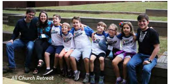
All Church Retreat

Let's craft for Advent! We are offering a kids' day out so we can spend time crafting, playing games, and having fun! Come full of energy ready to cut, decorate, and be creative! FOR SPECIFIC DATE/DETAILS and to register your child(ren), go to www.shallowford.org .