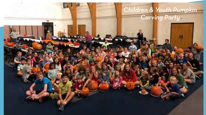
Children & Youth Pumpkin Carving Party