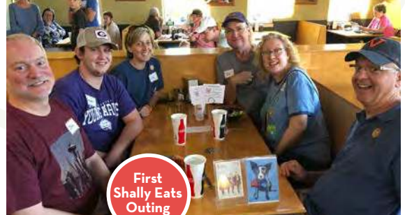
First Shally Eats Outing