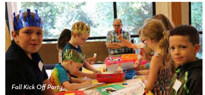
Fall Kick Off Party