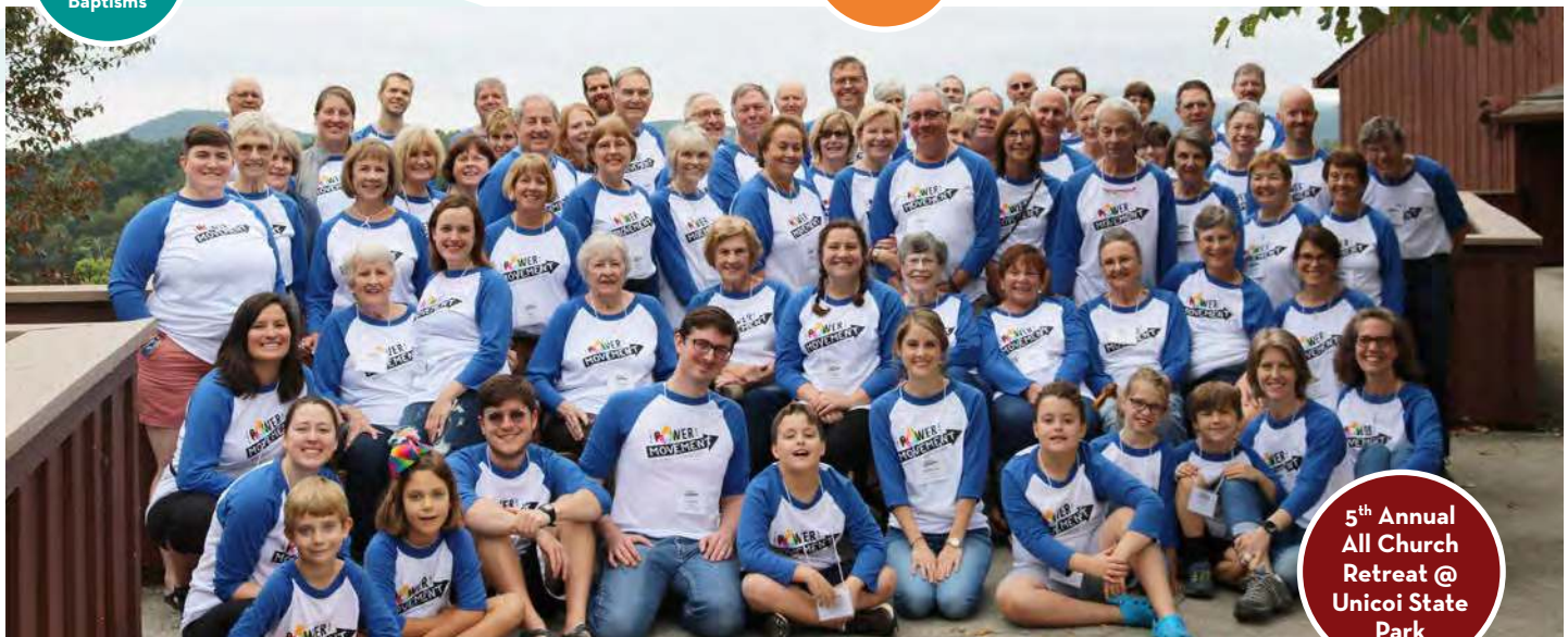
5 th Annual All Church Retreat @ Unicoi State Park