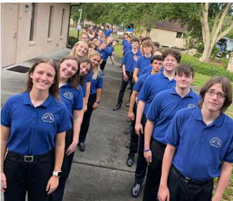
Chapel Choir members on tour in Florida.

Raleigh Youth Mission allows young people to explore the hidden needs and struggles of those living on the margins within and around the City of Oaks. Together, Shallowford youth will serve alongside our neighbors who are homeless, in poverty, or food insecure.