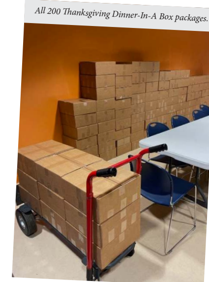
All 200 Thanksgiving Dinner-In-A-Box packages.

100 turkeys at a discounted price and let us keep them in their freezers until the big day. They even helped load our trucks when we picked them up," expressed Vaughn.