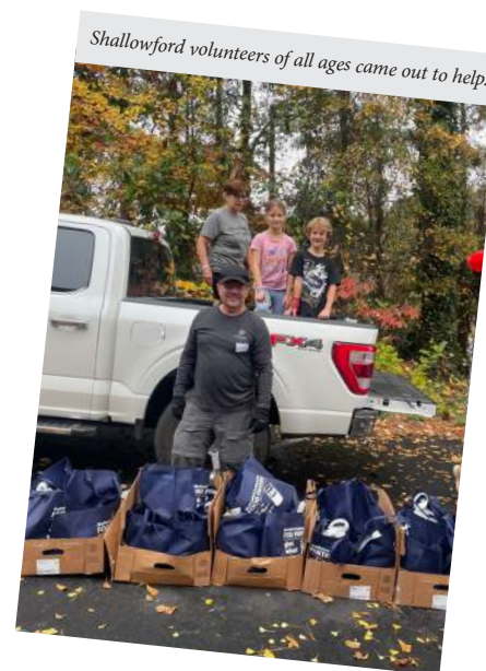
Shallowford volunteers of all ages came out to help.