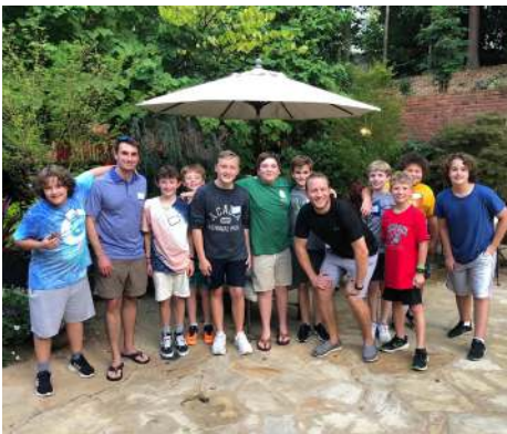
6th/7th Grade Boys Small Group and leaders.