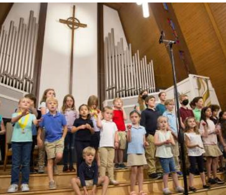
SPC Children's Choirs come together in song.