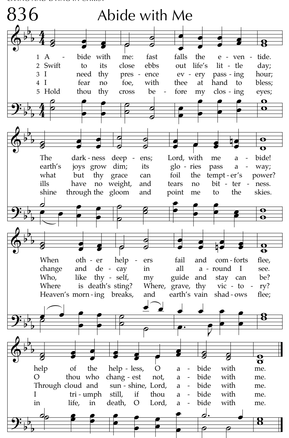
By blending end of day and end of life, the imagery of this well-known Victorian hymn has made it valuable for both evening services and funerals. Although the author wrote his own music for it, the present tune has been firmly associated with this text for over 150 years.